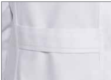
11P03R34: Martingala con automatici Half belt with press studs